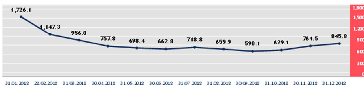
Open Foreign Currency Position Risk – VaR (99 %, 1 day) EUR thousand

Aside from foreign exchange risk from operating activities, Addiko is also exposed to an additional foreign exchange risk from the consolidation of Addiko Bank AG's strategic investment in Addiko a.d. Beograd (volume of approx. EUR 182.3 million) and Addiko d.d. Zagreb (volume of approx. EUR 385.2 million) as recorded in the statement of financial position. The strategic currency risk thus represents the majority of the risk in open currency items at Addiko. In addition to monitoring VaR in respect of foreign currency, Addiko also monitors any concentration of relevant single foreign exchange positions on single currency level - this is reported on a monthly basis within the Group Asset Liability Committee.